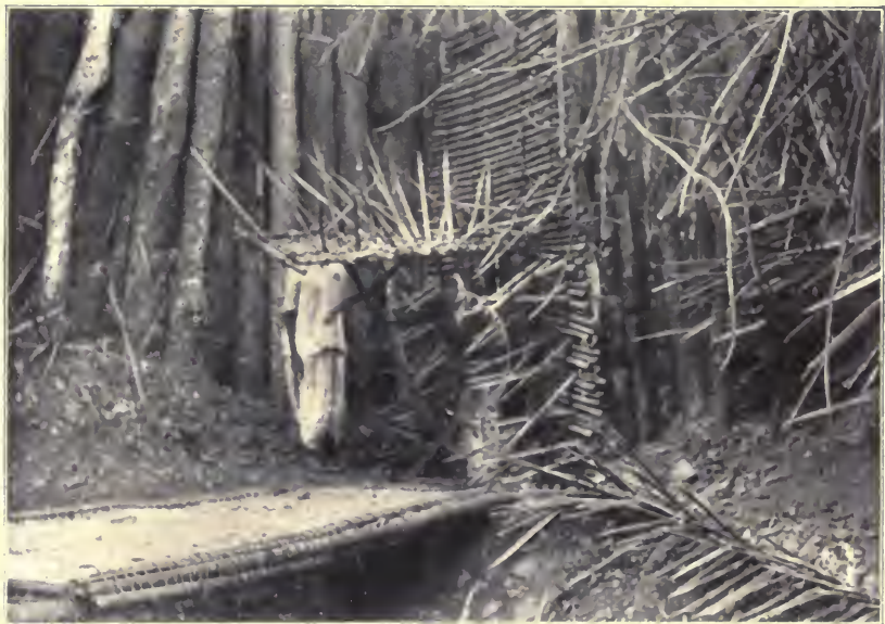
THE GATE CLOSED, WITH WICKET OPEN AND DRAWBRIDGE LOWERED.